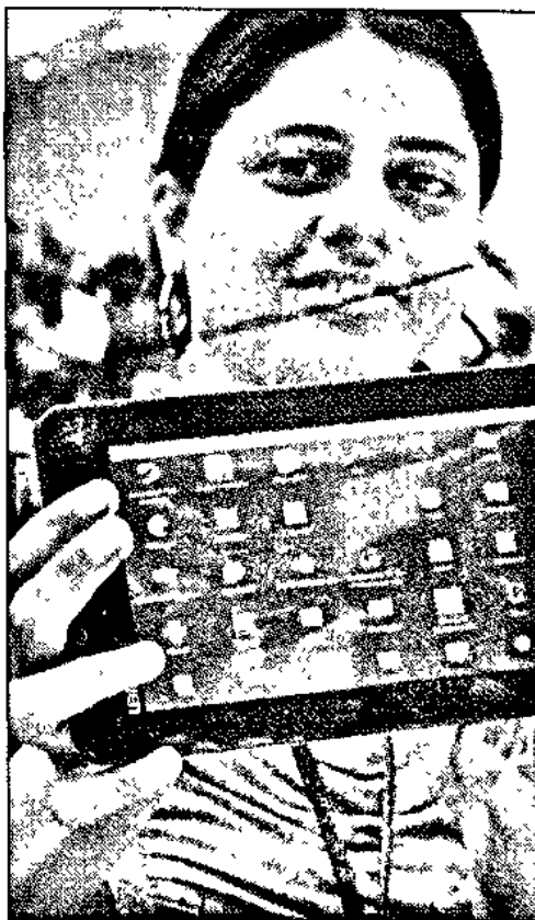
A student with an Aakash tablet

A HRD ministry official said the ministry was keen on making the