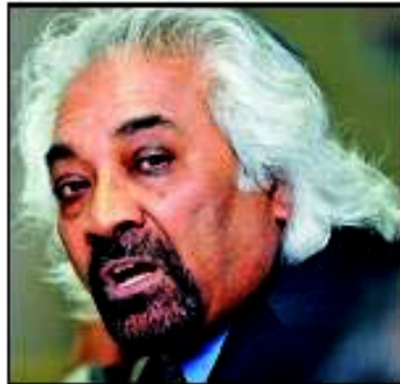
It is amazing to see primitive ways of proving power, says Pitroda

"We have set up a national innovation centre that will oversee state innovation centres and 100 sectoral innovation houses. We are setting up a venture fund of $1 billion to finance innovation. Today, the ordinary person with ideas has no access to money, and we will try to change that," he said, speaking at GridWeek Asia 2012, organised by the Indian Electrical & Electronics Manufacturers' Association